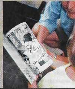
LIKE MAGIC: New machine can print and bind books within minutes